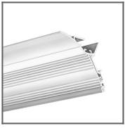
LIT-L Extrusion Ref: 18033NA