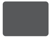
End cap (D)